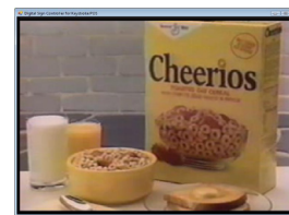
Single panel HTML feed