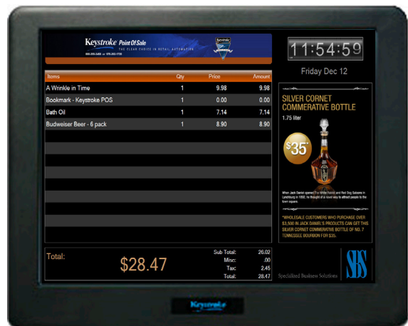
Sample customer's view at the point of sale. (Other display configurations are also available.)

Increase sales and enhance your customer's shopping experience!